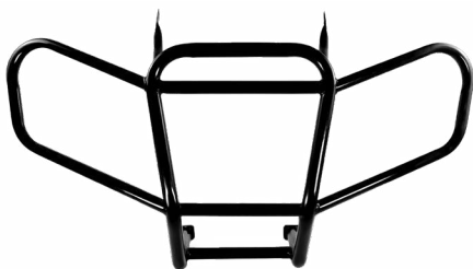
XRT FRONT STEEL BUMPER 11521G

The XR 500 rear bumper was designed to hold up to the demands of off-trail riding. Made with heavy-duty 1 1/4" steel construction, easy 4-bolt attachment system and a high-gloss powder-coated paint finish.