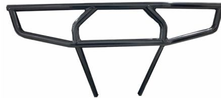
XR 500 REAR BUMPER 900-0312

Designed specifically for the XR 700, this ARGO-designed rear bumper is made with heavy-duty 1 1/4" steel construction. High-gloss powder coated paint provides protection to keep this bumper looking good. Easy 4-bolt attachment system makes installation fast and secure. This rear bumper makes the perfect bookend.