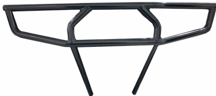
XR 700 REAR BUMPER 900-0321

Designed specifically for the XR 700, this ARGO-designed front brushguard is made with heavy-duty 1 1/4" steel construction. Easy 4-bolt attachment system makes installation fast and secure. The edge-to-edge, top to bottom protection provides piece of mind for your grill and radiator. High-gloss powder-coated paint provides protection to keep this brushguard looking good.