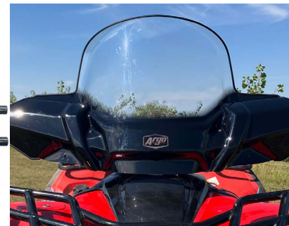
WINDSHIELD WITH MOUNT XR 500 900-0309 XR 700 900-0317

The XRT rear bumper was designed to hold up to the demands of off-trail riding. Made with heavy-duty 1 1/4" steel construction, easy 4-bolt attachment system and a high-gloss powder-coated paint finish.