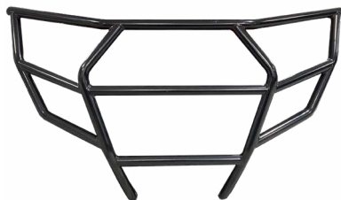
XR 700 BRUSHGUARD 900-0320

Application: 2022 - Current Xplorer XR 700 EPS/700 LE